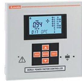
Automatic power factor controller, 8 steps, icon display DCRL8